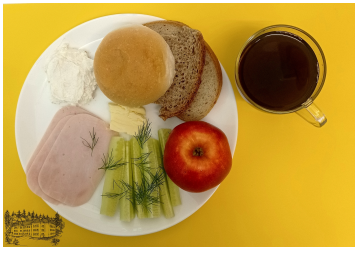
06.11.23 ŚNIADANIE - DIETA LEKKOSTRAWNA